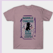
NEW! Show print inspired tee

Show your love for GCC and for women in country music when you buy some swag in the Girl Crush Country Store ! Choose just the logo or pick a design with some added sass if you roll like that. Every design is available on multiple styles, colors, and items.