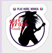
Play. More. Women. magnet