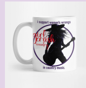
I Support Women's Wrongs mug