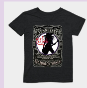
Girl Crush Whiskey Label Tee